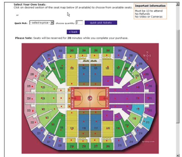
Venue Seating Chart